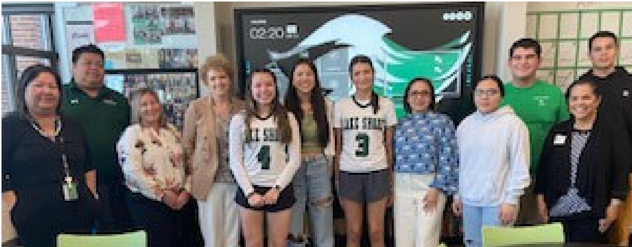
Students and staff representing Lake Shore’s Native American programs met with State Education Department officials during their visit to learn more about programs for Seneca Nation students attending Lake Shore, Gowanda and Silver Creek schools.